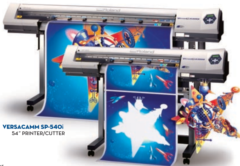
VERSACAMM SP-540i 54" PRINTER/CUTTER