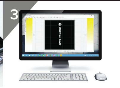
3 Laser imprint your design via METAZAStudio Software