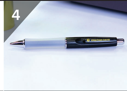
4 Your customized object is ready to sell